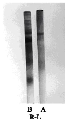
Fig. 1: The electrophoretic separation of leaf protein in the Manihot species, A- Manihot glaziovii , B- Manihot esculenta

The bands at 2.2, 2.7 and 3.7 cm are commonly shared between the two species and occur in different intensities. This means that the common band relationship between the two species is 3. The band between 5.0 and 5.9 cm is characteristic of Manihot glaziovii . The coefficient of similarity between the two species is 63.6%.